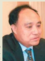
Houlin Zhao Deputy Secretary-General of ITU

ITU Prods Companies for 2009 Event, Calls on Japanese SMEs _____ 42