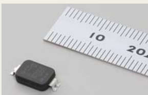
DK Series type EA capacitor (39)