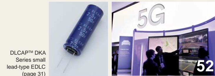
DLCAP™ DKA Series small lead-type EDLC (page 31)